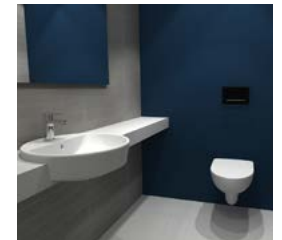
PACKAGE 3 SELECT