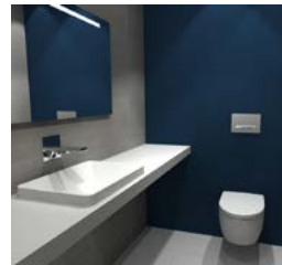
PACKAGE 1 ASPIRE PLUS