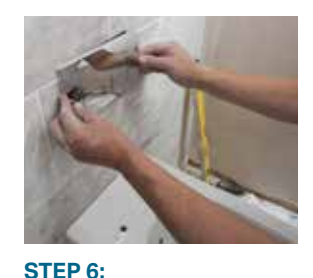
FIX WC AND FLUSH PLATE

You are now ready to plaster and tile your installation. When you've completed that, you can cut down the protection housing flush with your tiles and remove the protection covers ready to fix the WC.