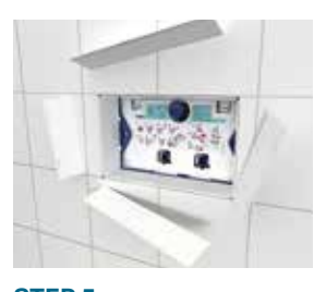
STEP 5: PLASTER AND TILE YOUR INSTALLATION

Once the frame is in position and the supply and drainage are connected, ensure that you protect the flush pipe, drainage connection and metal rods with the covers provided. This will stop debris building up during the plastering and tiling phase.