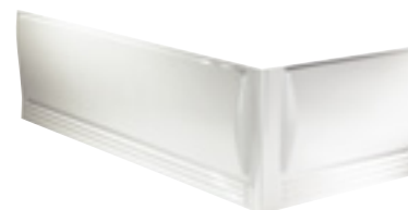
OMNIFIT Front panel 1700 / 1524mm End panel up to 800mm