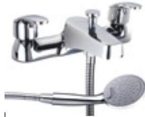
X52 BATH/SHOWER FILLER