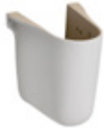
Round semi pedestal only