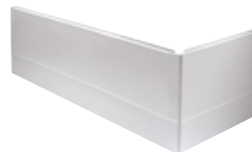
ENDURANCE Front panel 1700mm End panel 700 / 750mm

Twyford offer various types and sizes of bath panels to match all your requirements - some of our baths come with dedicated bath panels, see previous pages. The baths panels below are universal so can complement any bath without a dedicated panel. Twyford bath panels come in a number of different shapes and materials to complement any bathroom design.