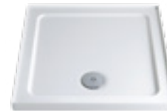
SQUARE UPSTAND TRAY 760 x 760mm 800 x 800mm 900 x 900mm