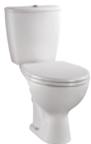
Close coupled with horizontal & vertical outlets

The entire Alcona toilet range features Twyford's water saving flushwise® as standard. Washbasins range from 350mm to 600mm and come with a full or semi pedestal.