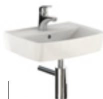
400, 500 600 square basin (1TH only)