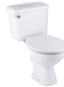
Toilet Suite Lever Cistern