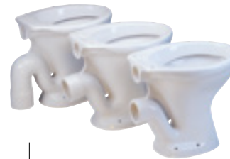
WC bowl - horizontal outlet - fixed P trap - fixed S trap