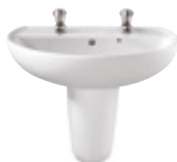
Washbasin 400, 550, 600mm (Available With Full or Semi Pedestal)