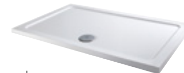
RECTANGLE FLAT TOP TRAY 900 x 760mm, 1000 x 760mm, 1000 x 800mm, 1100 x 800mm, 1200 x 760mm, 1200 x 800mm, 1200 x 900mm, 1400 x 900mm, 1500 x 800mm, 1600 x 800mm, 1700 x 700mm, 1700 x 750mm, 1700 x 800mm