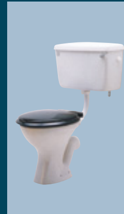
Twyford Classic P. 05