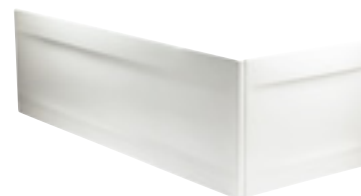
GALERIE CALLISTO Front panel up to 1700 / 1500mm End panel up to 700mm