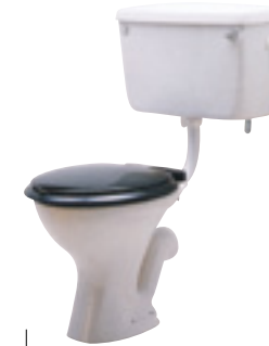
Low level washdown WC suite, horizontal outlet