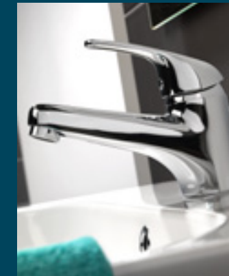
Twyford Brassware P. 16