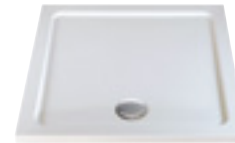
SQUARE FLAT TOP TRAY 760 x 760mm 800 x 800mm 900 x 900mm 1000 x 1000mm

Twyford offers a wide range of showering solutions from trays to mixers, providing the perfect combination of great value and quality for your affordable housing project.