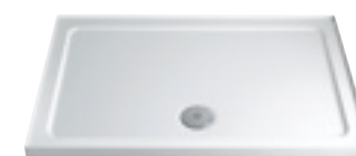
RECTANGLE UPSTAND TRAY 900 x 760mm, 1000 x 760mm, 1000 x 800mm, 1200 x 760mm, 1200 x 800mm, 1400 x 900mm, 1700 x 750mm