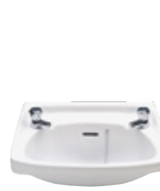
Washbasin 560mm 2 tap holes