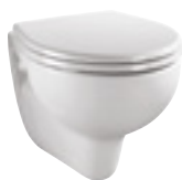
Wall-hung with horizontal outlet