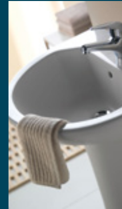
Twyford Option P. 06