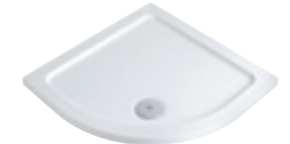
QUADRANT FLAT TOP TRAY 800mm 900mm 1000mm