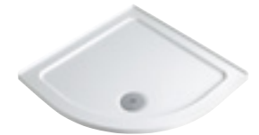
QUADRANT UPSTAND TRAY 800mm 900mm