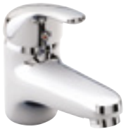
X52 BASIN MONO MIXER