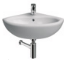
350 round corner basin (1TH only)