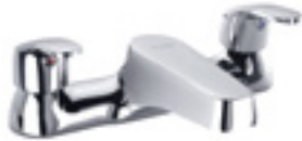
X52 BATH FILLER