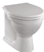
Back to wall with horizontal outlet