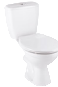
Toilet Suite Push Button Cistern

Choose from a wide range of flexible products such as a lever cistern toilet or opt for a water saving dual flush. Our handrinse washbasin will maximise a smaller bathroom, or you can choose a larger basin allowing you to adapt to the space available.