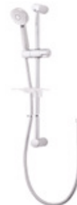
SOLA SHOWER RAIL, HOSE AND HEAD