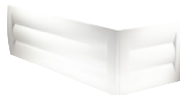
NEPTUNE Front panel 1700 / 1500mm