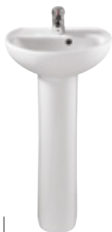
400, 500, 550 & 600 round basin (1TH & 2TH)