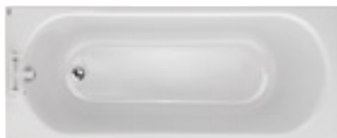
OPAL TREAD 1700 x 700 / 1500 x 700 Soft tread pattern covers full length of base (low capacity option available)