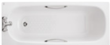
CELTIC 1500mm x 700mm, 1600mm x 700mm, 1700 x 700mm (low capacity option available)