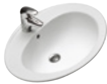
560 round countertop basin (1TH only)