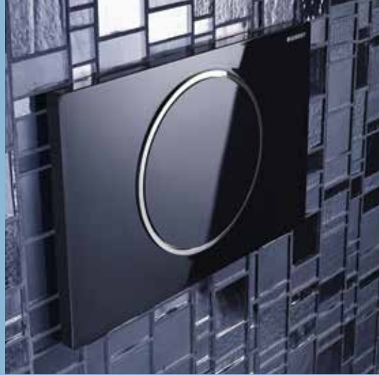
Sigma 10 infra red