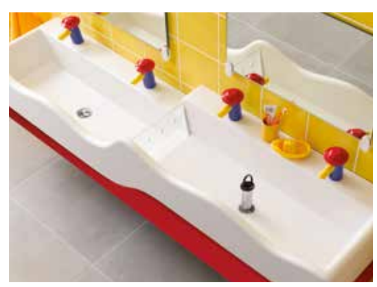
Geberit Bambini wash trough