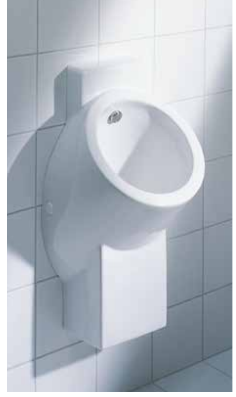
Centaurus Waterless Urinal