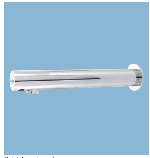
Sola infra red spout

TAPS IN NURSERIES, SCHOOLS, COLLEGES AND UNIVERSITIES HAVE TO COPE WITH A WIDE VARIETY OF CHALLENGES. OUR COMPREHENSIVE RANGE COVERS EVERY WATER-SAVING, TEMPERATURE-CONTROLLED, FLOWRESTRICTED, BREEAM COMPLIANT OPTION YOU NEED.