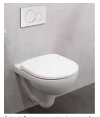
Geberit Selnova round wall-hung toilet Geberit Selnova toilet with cistern

Twyford Alcona ranges and Geberit Selnova ranges combine water saving efficiency with innovative functionality. From dual flush button operation to space optimising design solutions, we have it covered.