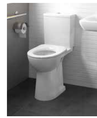
Geberit Selnova raised height toilet