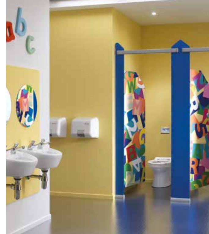
Sola Rimless back-to-wall toilet and washbasins