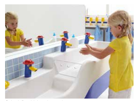
Geberit Bambini wash trough