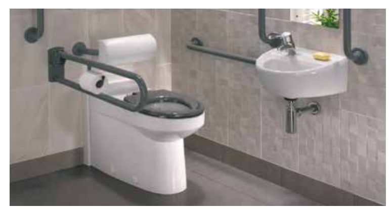
Doc.M rimless back-to-wall pack

With Doc.M rimless packs, robust grab rails, raised height toilets, long and short projection toilets and accessible washbasins, if there's anything we can do to help, you'll find it in our range.