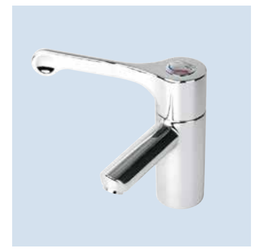
Sola TMV3 Basin Mixer

These taps and mixers meet every contemporary washroom or bathroom need, combining affordability with advanced technology and WRAS approved materials. All basin mono taps are fitted with clicker wastes and flexible tails as standard and flow regulators can be added to control water usage and comply with BREEAM.