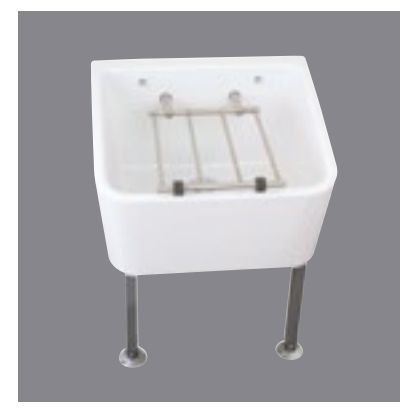
Twyford Cleaners sink

Our pioneering approach to washing troughs and cleaner's sinks makes environments safer, more accessible and infinitely more hygienic.