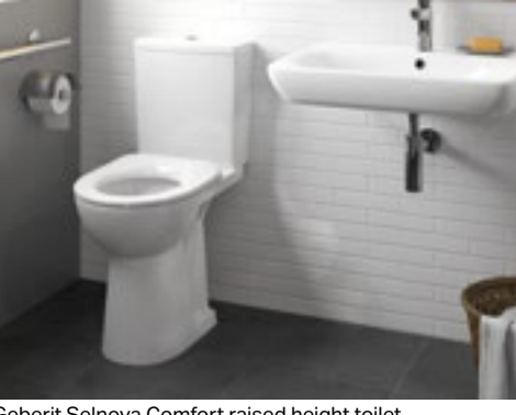
Geberit Selnova Comfort raised height toilet