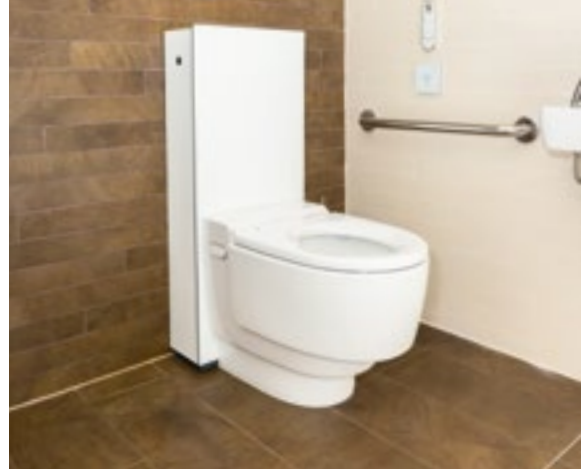
Geberit Mera Care shower toilet