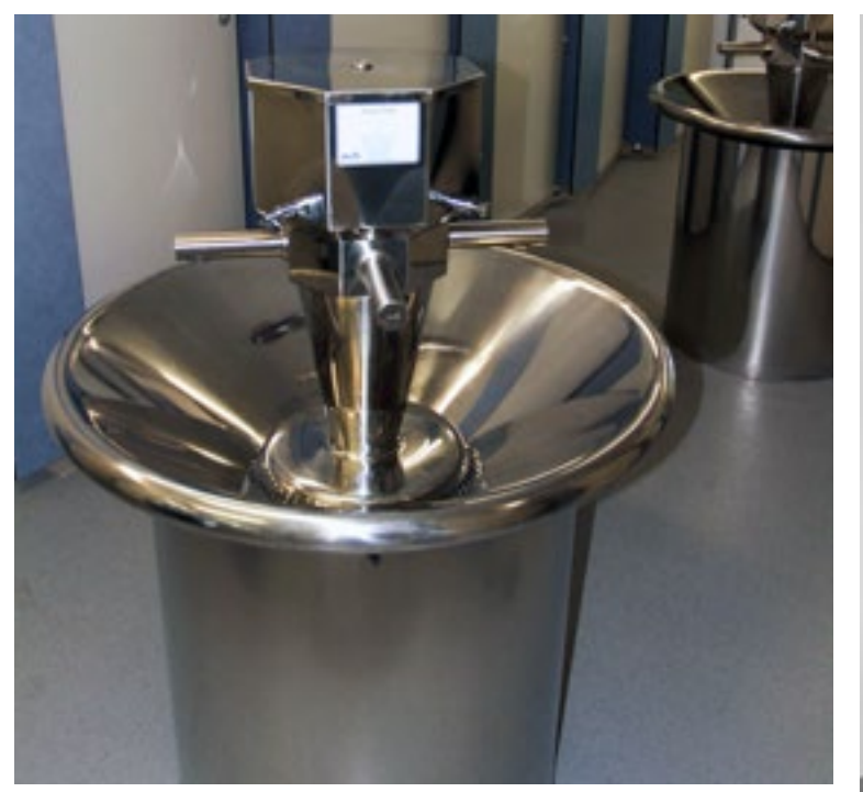
Twyford Circular washstation