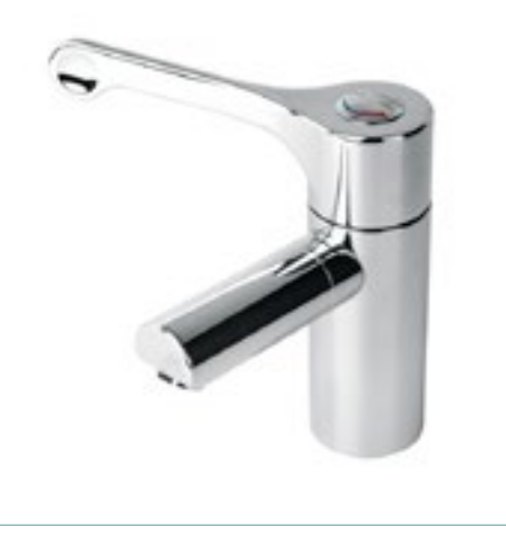
Twyford TMV3 basin mixer with detachable spout