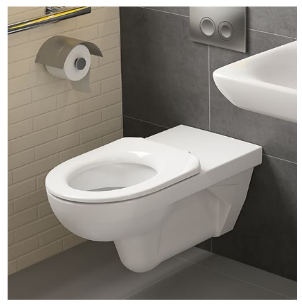
Geberit Selnova Comfort extended projection pan

With Twyford Doc.M rimless packs, robust grab rails, raised height toilets, long projection toilets and accessible washbasins, if there's anything we can do to help, you'll find it in our range.