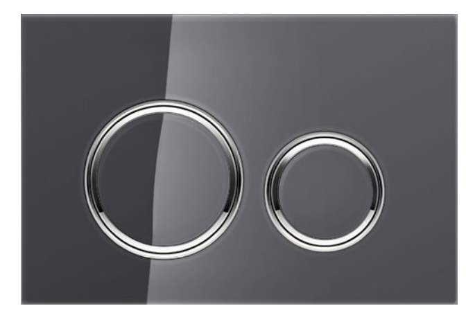
↑ Sigma10 Lava Glass

→ MODERN BATHROOM DESIGN HAS BEEN INCREASINGLY FOCUSED ON ADDING COLOUR ELEMENTS TO ACHIEVE THE PREERRED ATMOSPHERE.