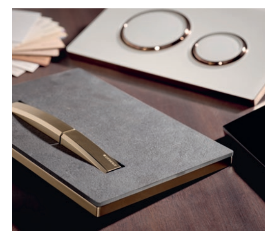
↑ Use consistant finishes across the bathroom