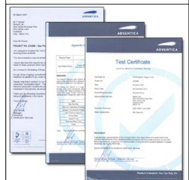
Advantica Gas Certification