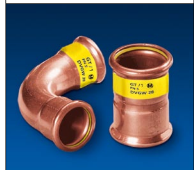
Copper Gas Mapress couplings