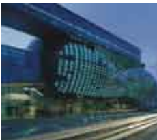
Kunsthaus Graz Entertainment Facility, Austria 2003