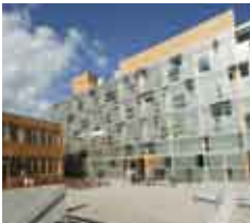
The Cube Hotel, Austria 2004