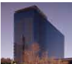
Sheraton Arabella Hotel, Cape Town, South Africa 2003

Architects: Peter Cook & Paul Fournier, London