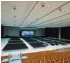
Stadthalle Graz Town Hall, Austria 2002